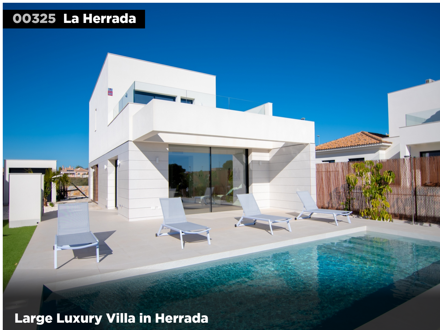
Large Luxury Villa in Herrada