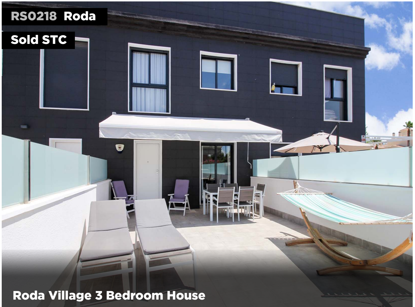
Roda Village 3 Bedroom House