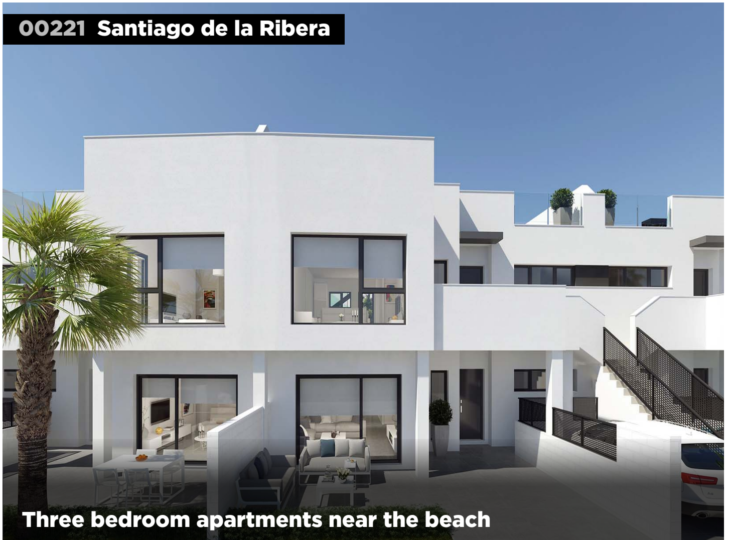
Three bedroom apartments near the beach